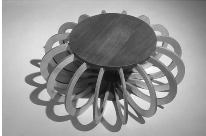
Figure 1: Functional object with a cultural story interpreted by designer: Woods Meeting Stool (Project: Kara Pinakis)

'When two parts conglomerate in an Aboriginal painting by Peter Woods my personal understanding is grasped. Two creatures meet – they touch – against a backdrop of melded, flesh-like tones as if to describe the ever occurring cycle of rebirth and reproduction. The form of my piece is an expression of my reading (Figure 1). Two contrasting timbers melt into one another to form a new skeletal whole' (Pinakis, 2002, exhibition panel).